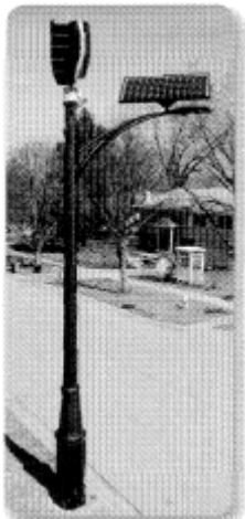
Figure C: Respondent's Product