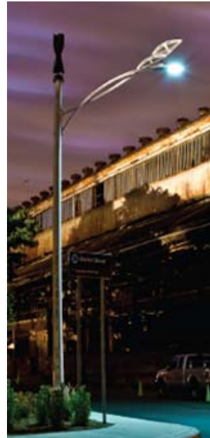
Figure B: Complainant's Product